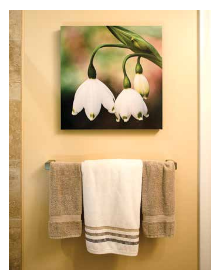
Celebrate Home Magazine / Winter 2013 27